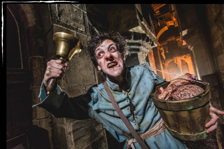
THE FOUL CLENGER