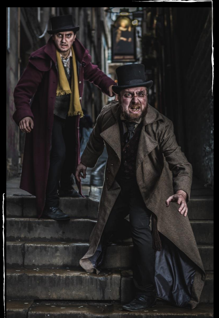
BURKE & HARE